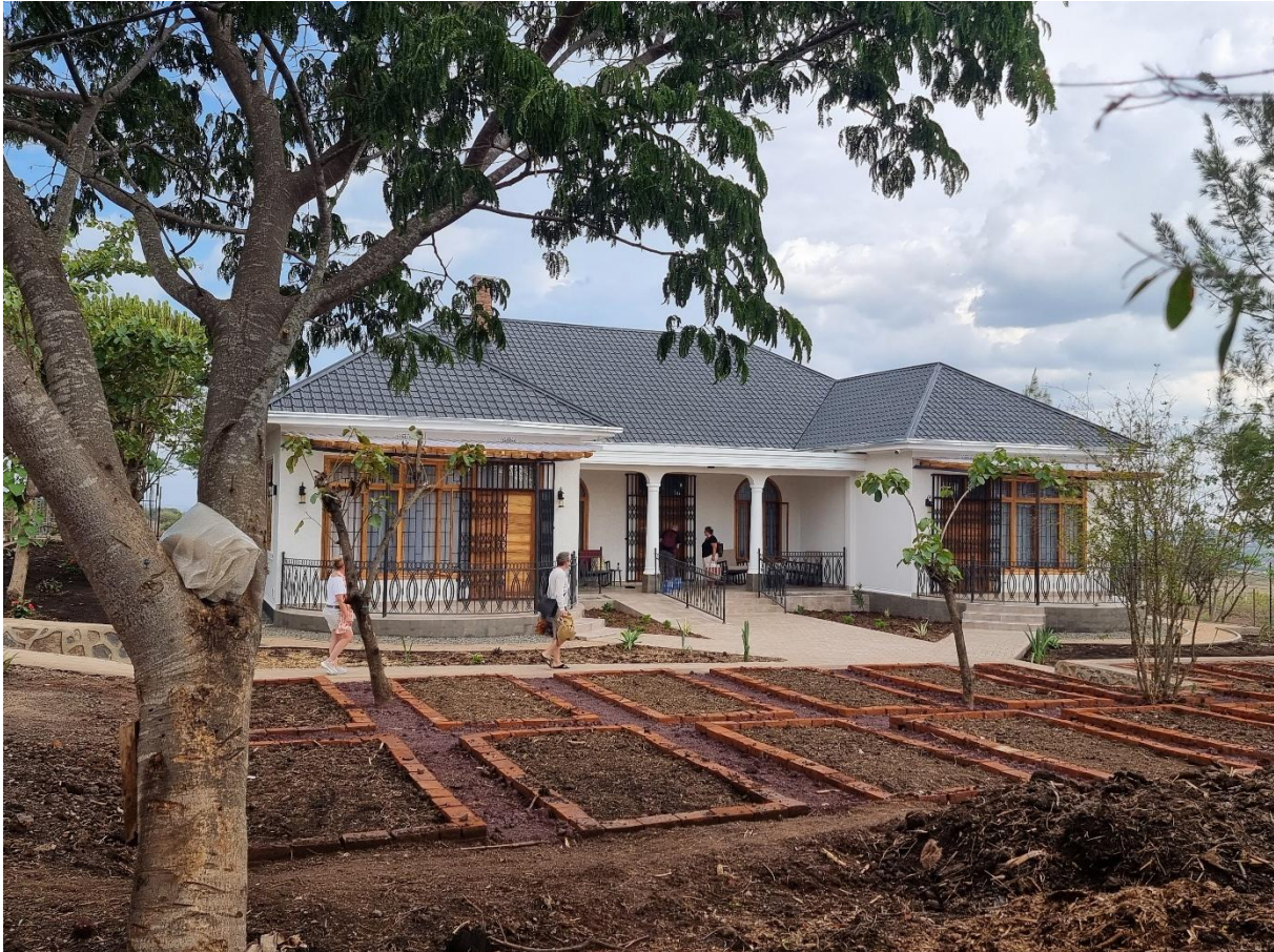
Front of the house with vegetable garden, which is newly prepared before the rainy season. To the left and right are two of the guest rooms with their own balconies, in the middle the terrace for sundowners with a view of the boys' dormitory of the orphanage.

Our accompanying guests are cordially invited to be "right in the middle of it", at the same time without missing the usual comfort of a good hotel. The room prices are significantly lower than those charged in Arusha for comparable facilities. Nevertheless, after deducting the costs, there is enough left over to generate an income for the center. Of course, this alone is not sufficient, but it is a building block of our plan for sustainable financing.